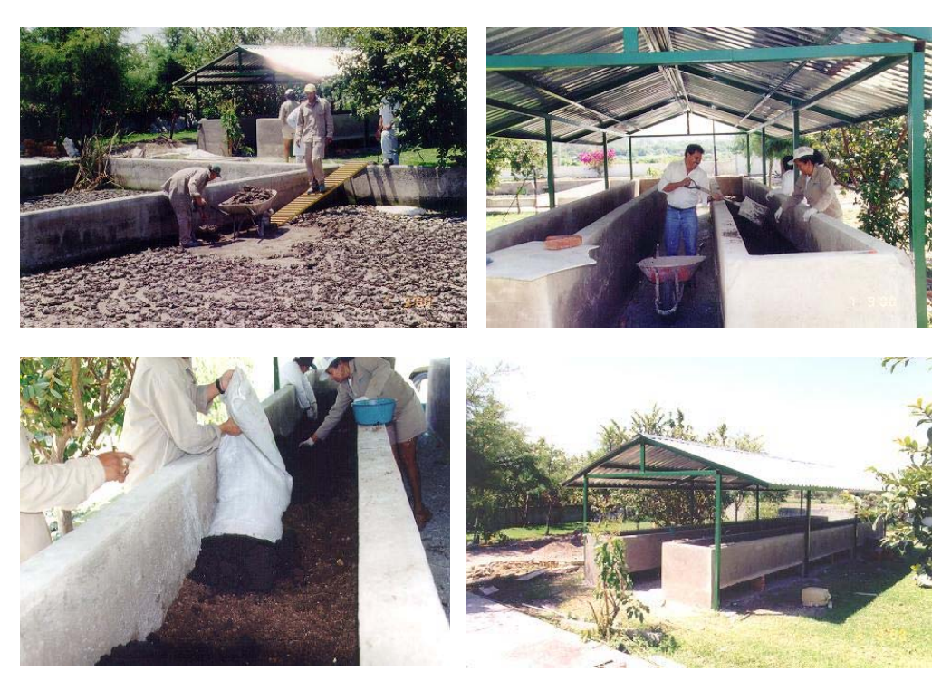
Figure 1. Vermicomposting treatment in the small plant of Chapala